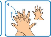
4 Baby, how you feelin'? (Feelin' good as hell)