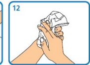
12 If you need advice, let me simplify