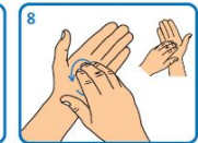
8 In there, swimwear, going-to-the-pool shit