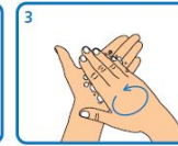
3 Hair toss, check my nails