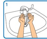
1 I do my hair toss, check my nails