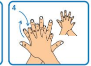
4 Baby, how you feelin'? (Feelin' good as hell)