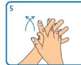
5 Woo, child, tired of the bullshit