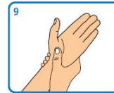
9 Come now, come dry your eyes