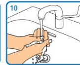
10 You know you a star, you can touch the sky