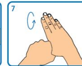
7 Yes, Lord, tryna get some new shit