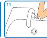
11 I know that it's hard, but you have to try