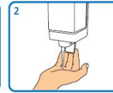
2 Baby, how you feelin'? (Feelin' good as hell)